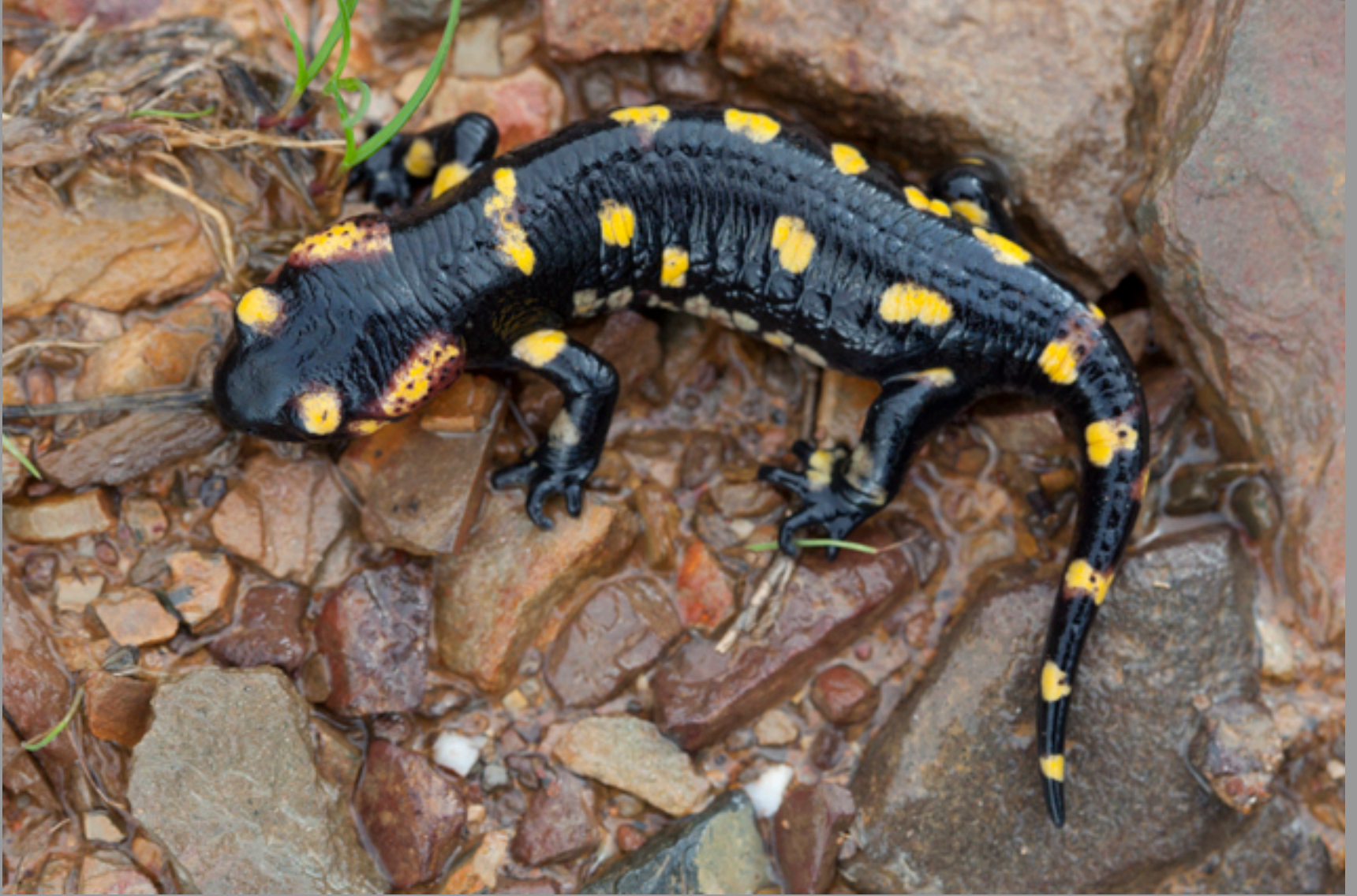
subadult female, very short tail again...