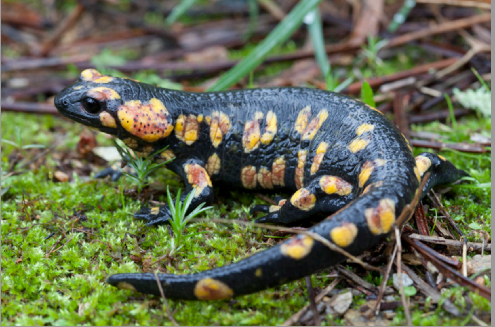
Salamandra salamandra morenica