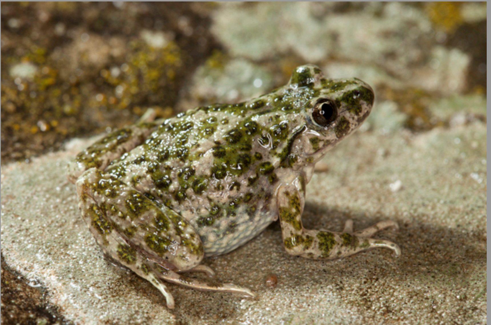
Pelodytes ibericus , female

Large flood in this part of Spain, I've never seen a such thing. Then, not easy to make pictures outside...But for the good news, amphibians were rather easy to find, especially on the road (dead and alive). Pelodytes ibericus was calling everywhere in large number. A night drive gave 2 small Salamandra salamandra longirostris , but the Jeroen's team was more lucky finding 3 Salamandra whose a huge pregnant female. The same night, I decided to reach a place where a population of S. s. longirostris is known. About 1 hour of shit night walk under the heavy rain, but fortunately I did find 5 big salamanders. Also Discoglossus galganoi jeanneae .