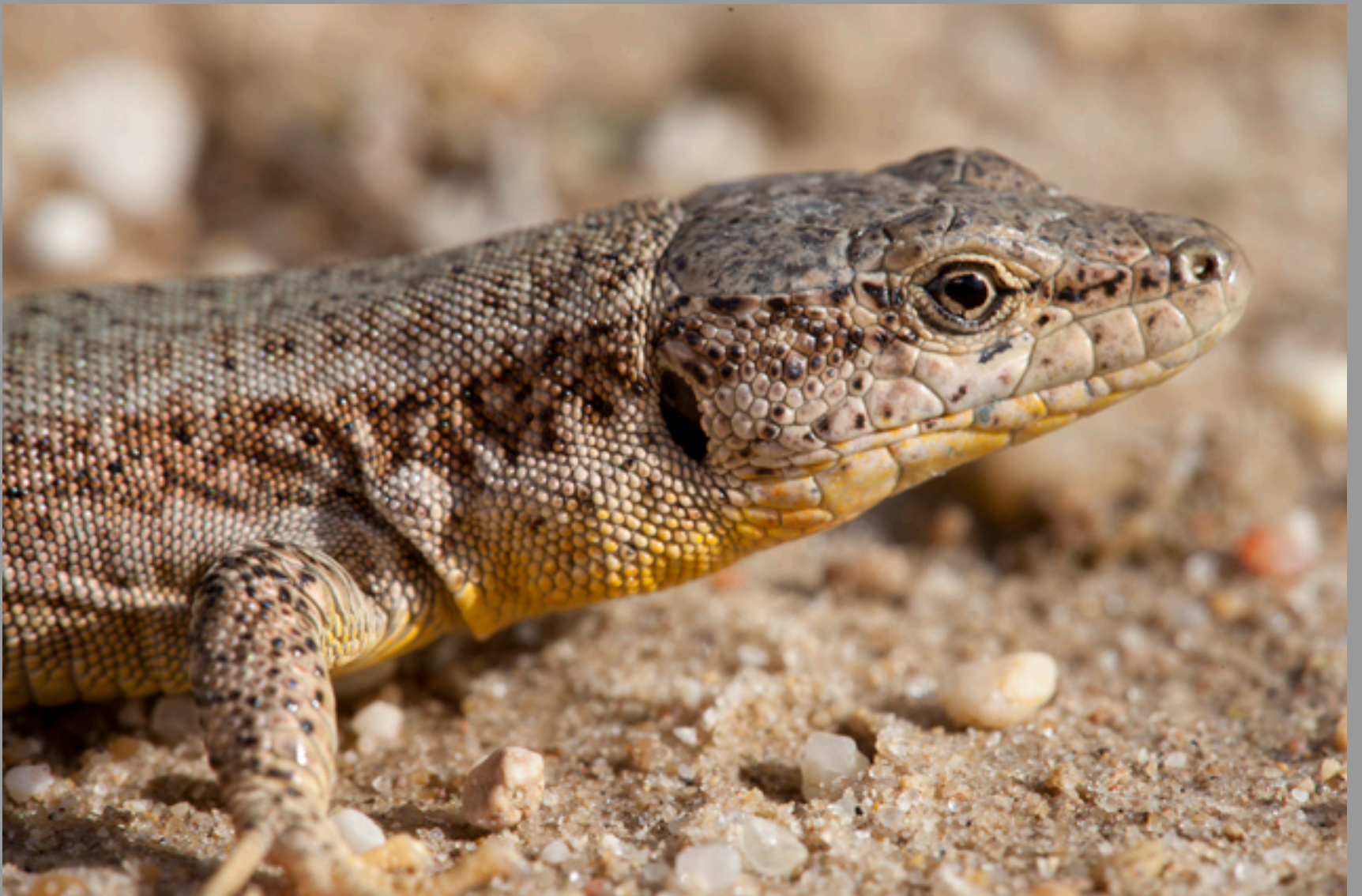
Podarcis vaucheri , male