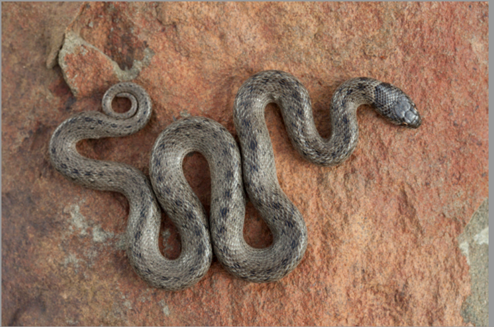
Macroprotodon brevis ibericus