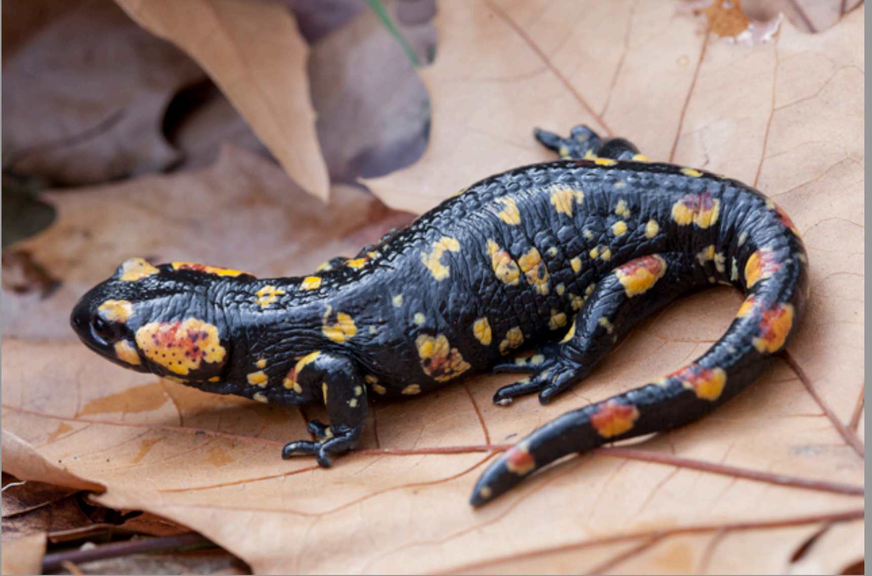
Salamandra salamandra crespoi