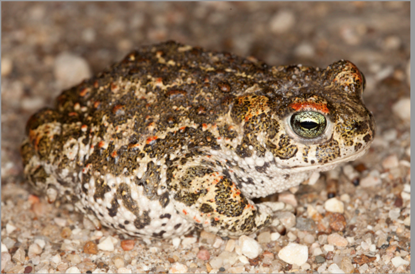
Bufo calamita , female