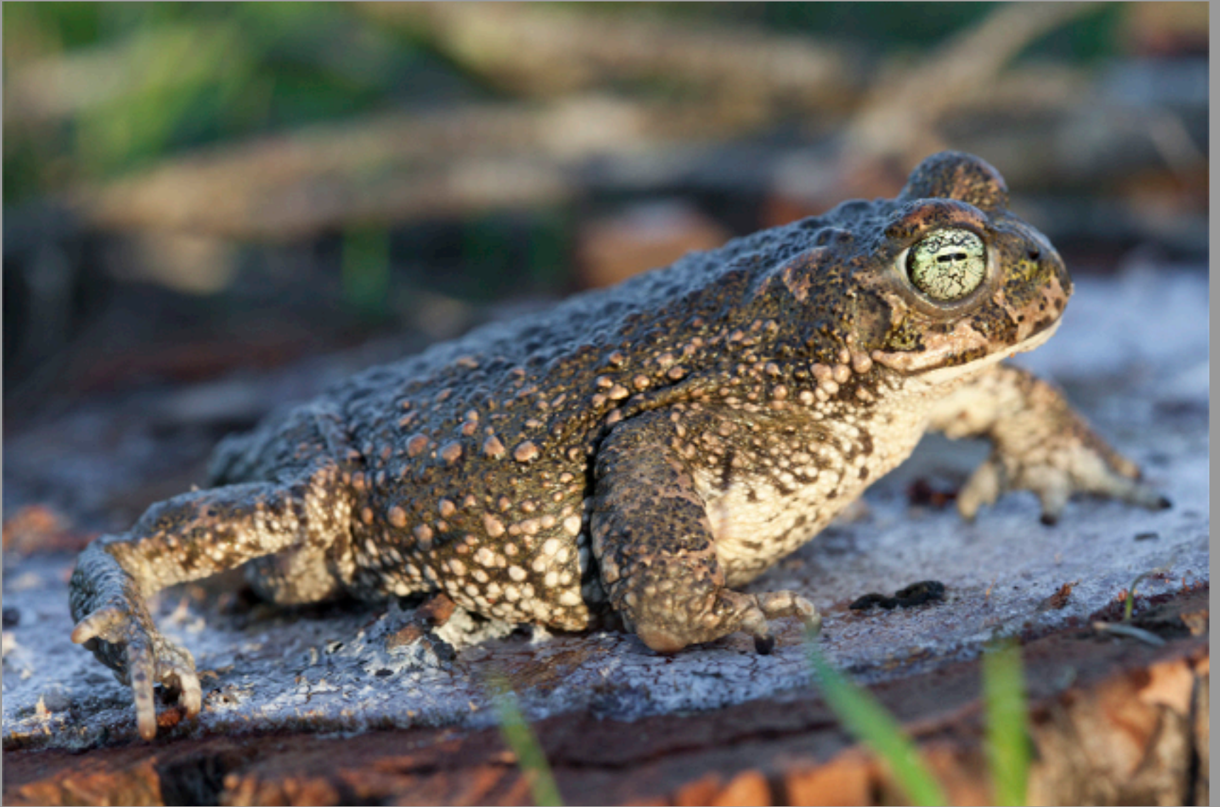
and again a Bufo calamita , female