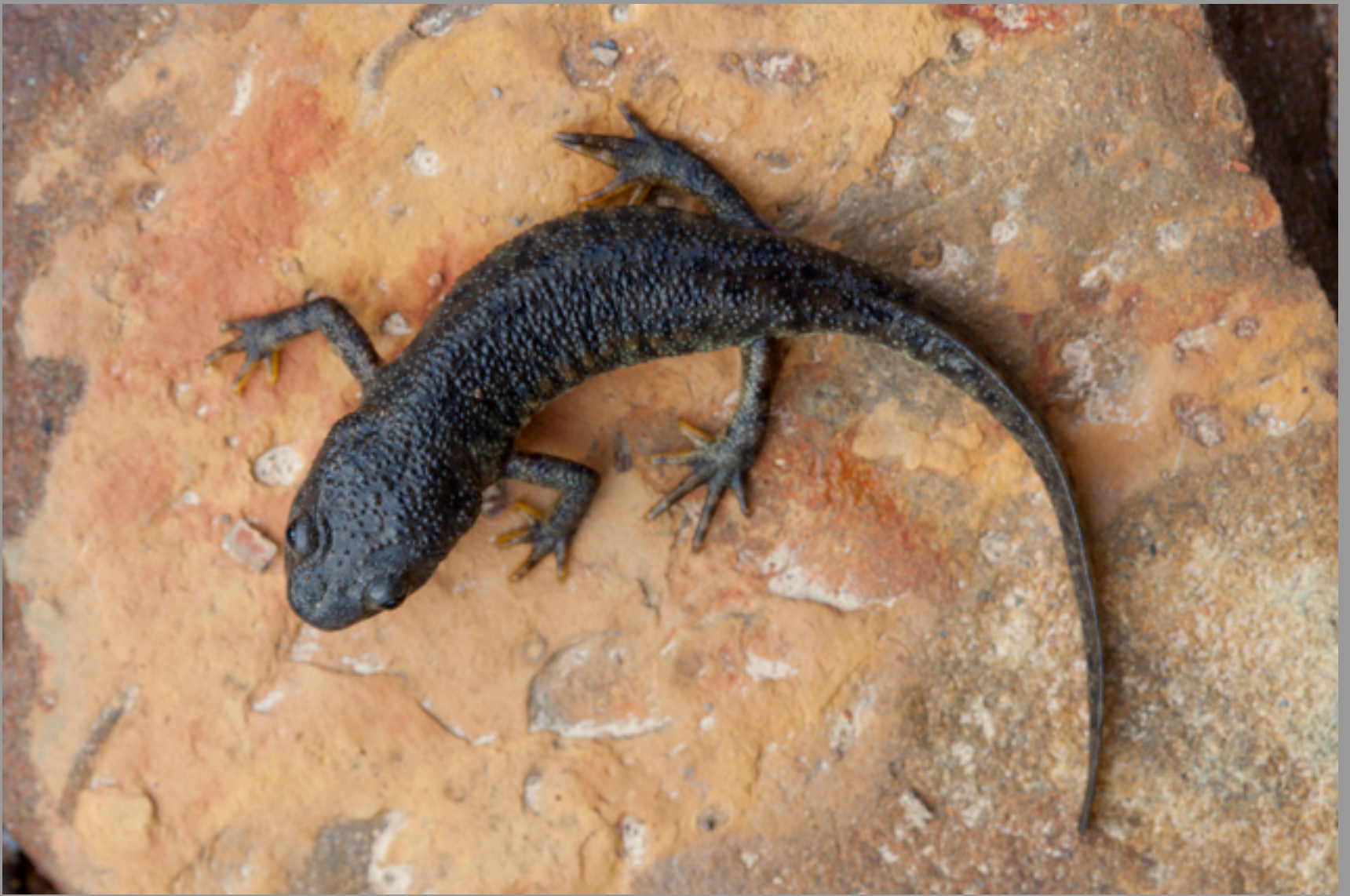
Pleurodeles waltl , young