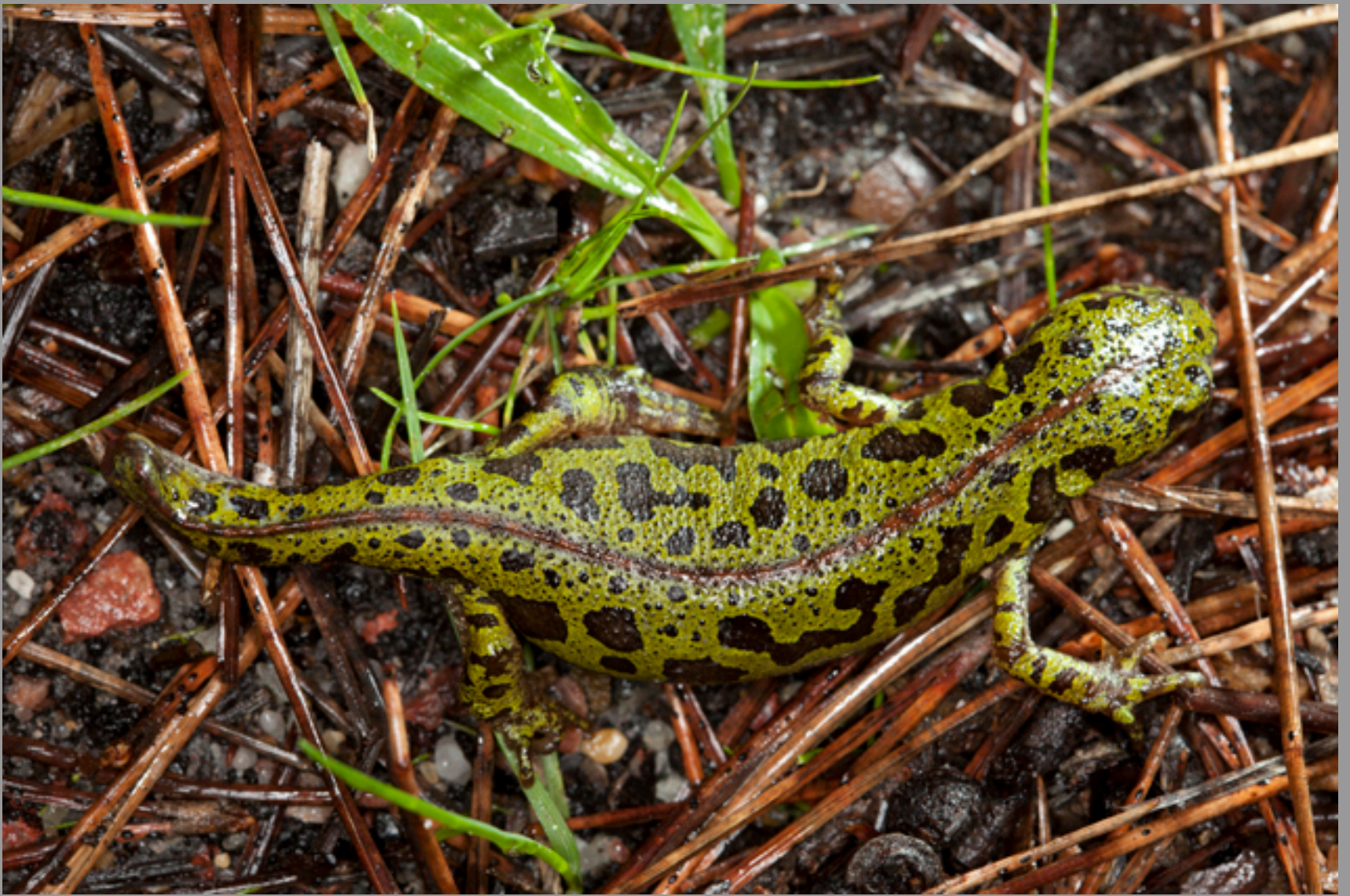
other with truncated tail