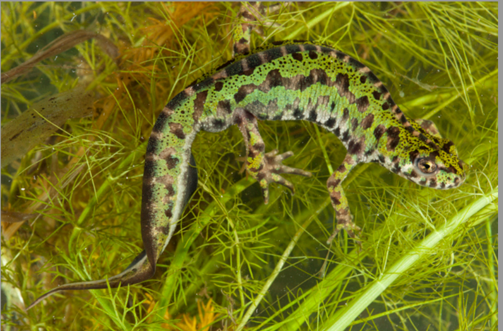
Triturus pygmaeus , male