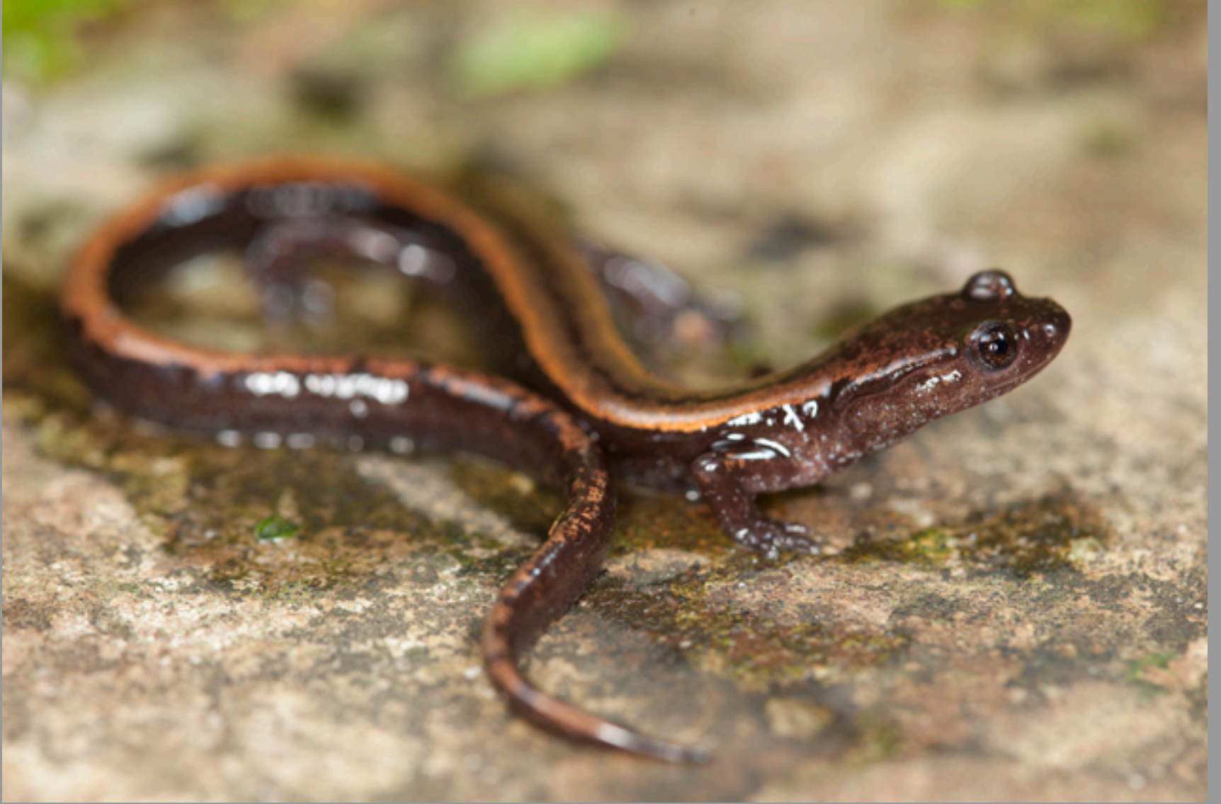
Chioglossa lusitanica lusitanica