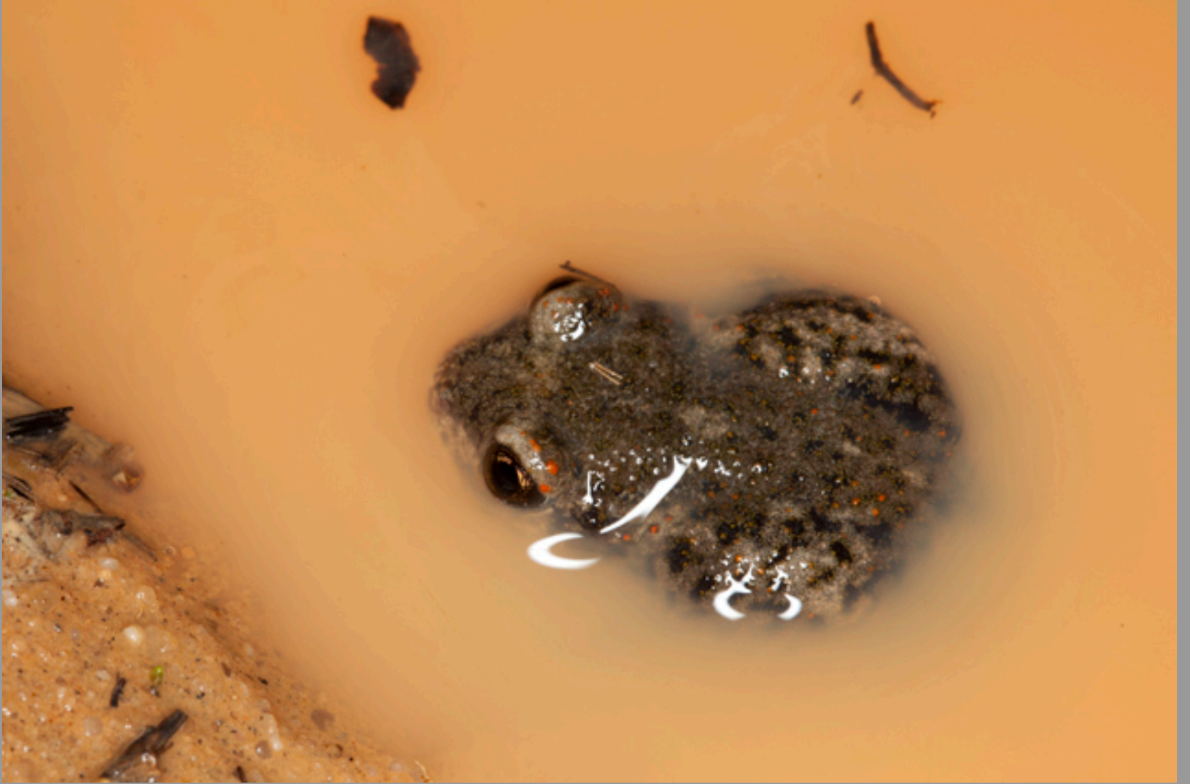
Alytes cisternasii , young