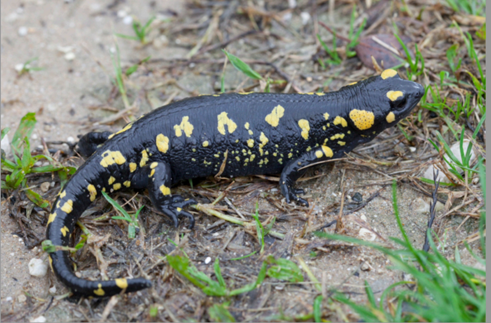
other big gravid female