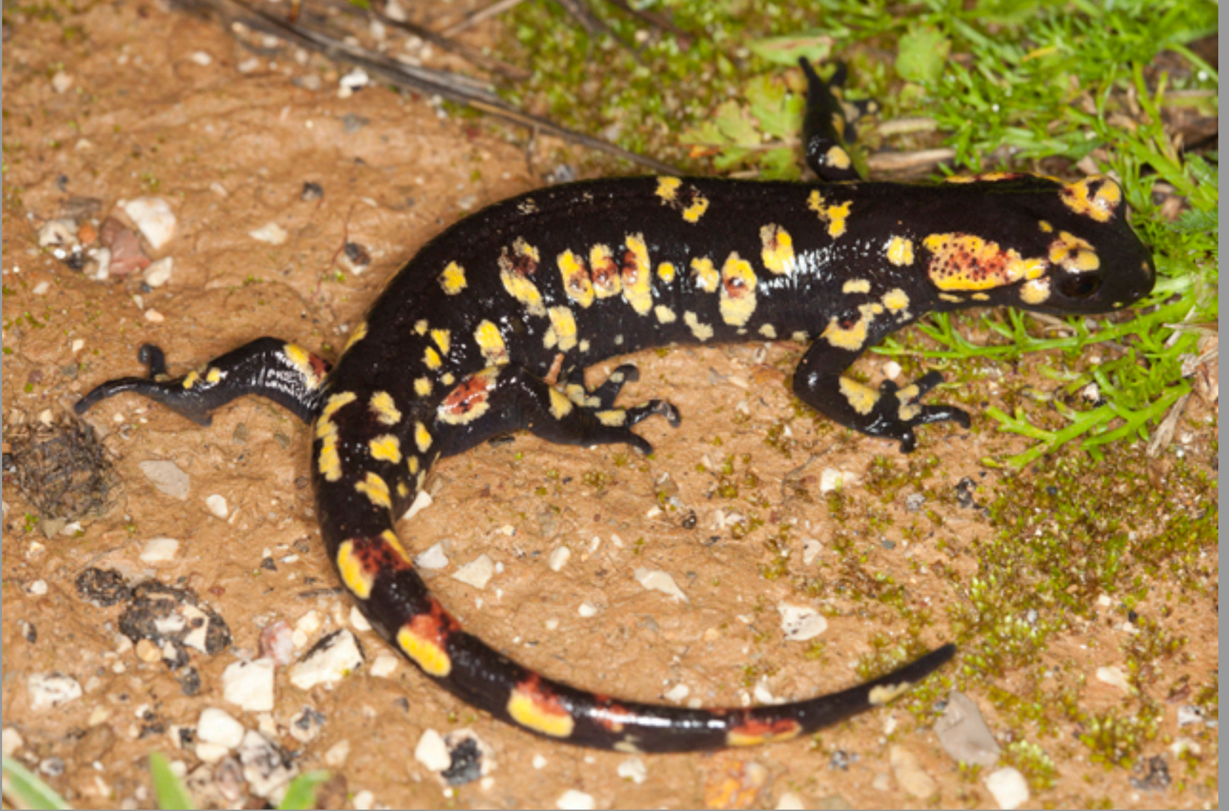
Salamandra salamandra crespoides x S. s. morenica ?