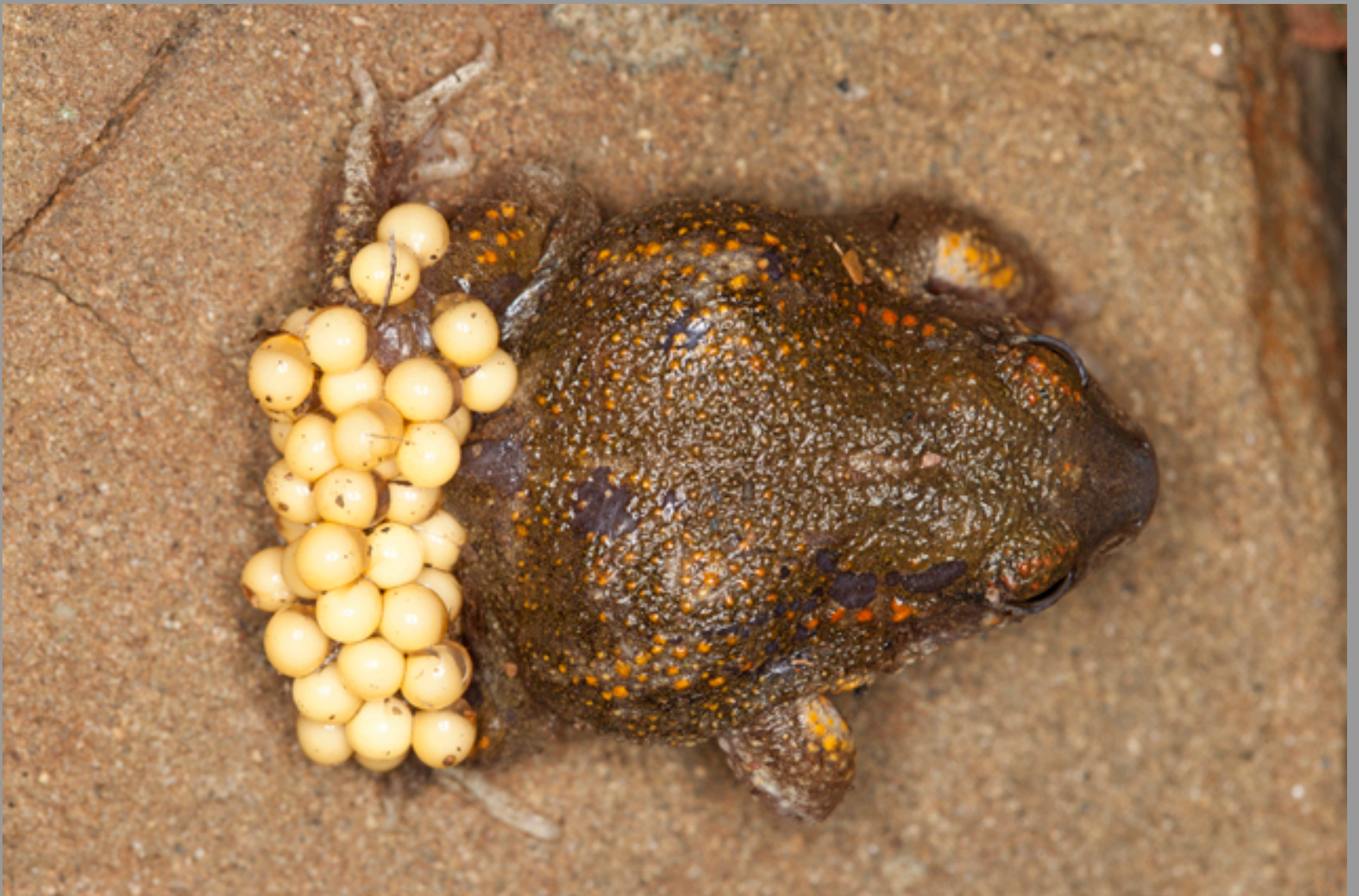
Alytes cisternasii , male with eggs