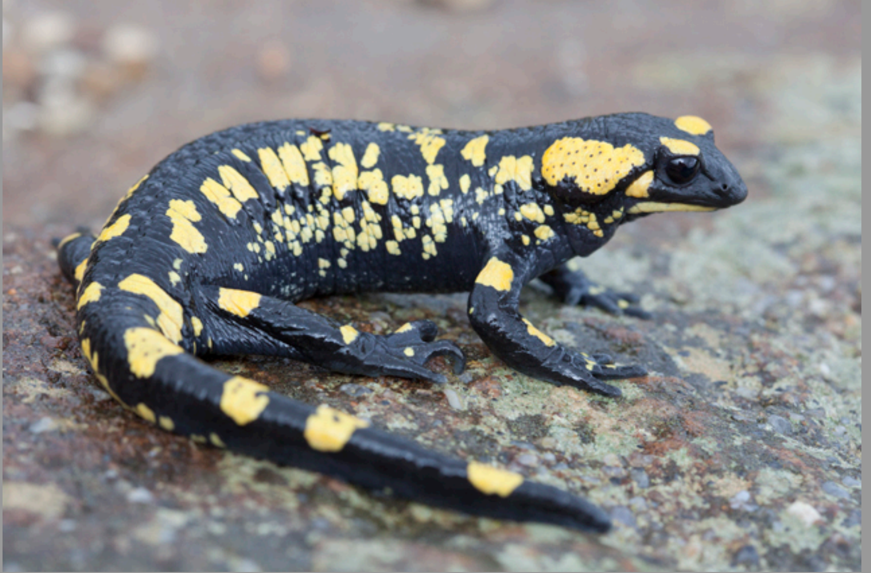
Salamandra salamandra longirostris , female