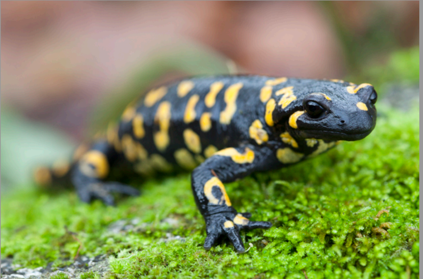
Salamandra salamandra crespoi

I reached once again Monchique in a hurry, but this time, rain and 15°C is enough to admire 15 Salamandra salamandra crespoi . 2 other ones were found near Foia. Also another dead on road.