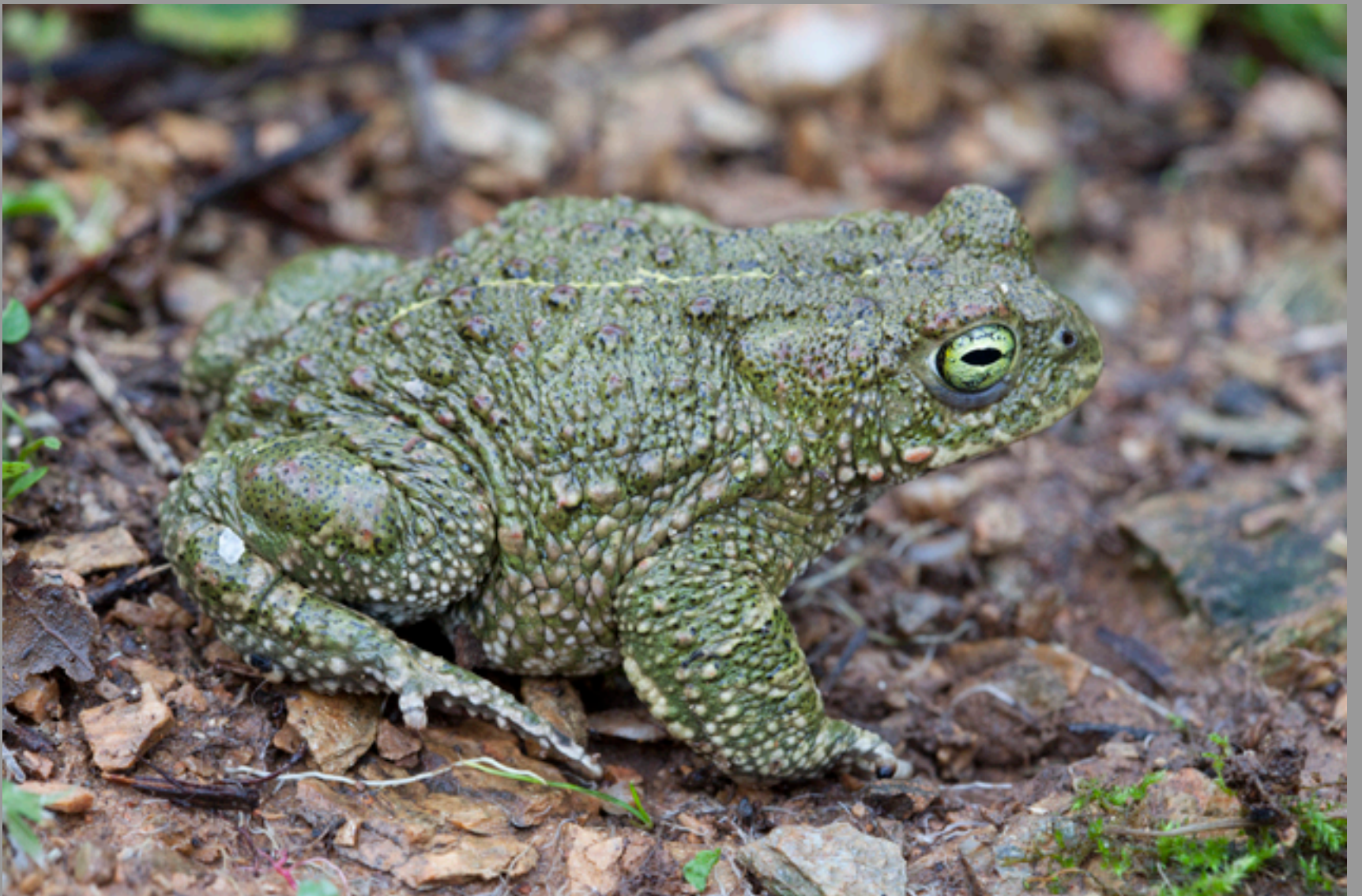
Bufo calamita , male