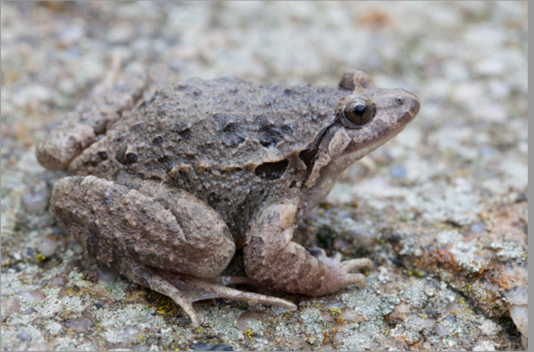
Discoglossus galganoi jeanneae