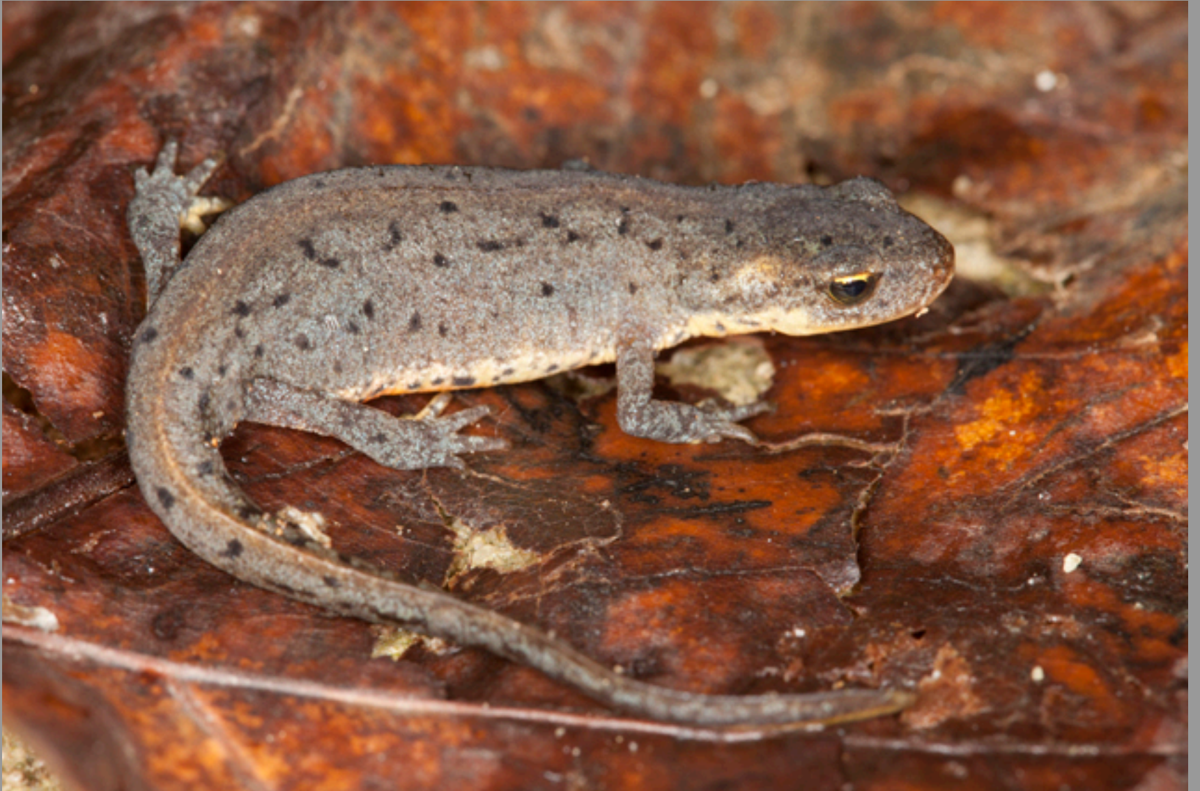
Lissotriton boscai boscai , female

A short stop to Campofrio, but only 3 Lissotriton boscai boscai could be found under stones.