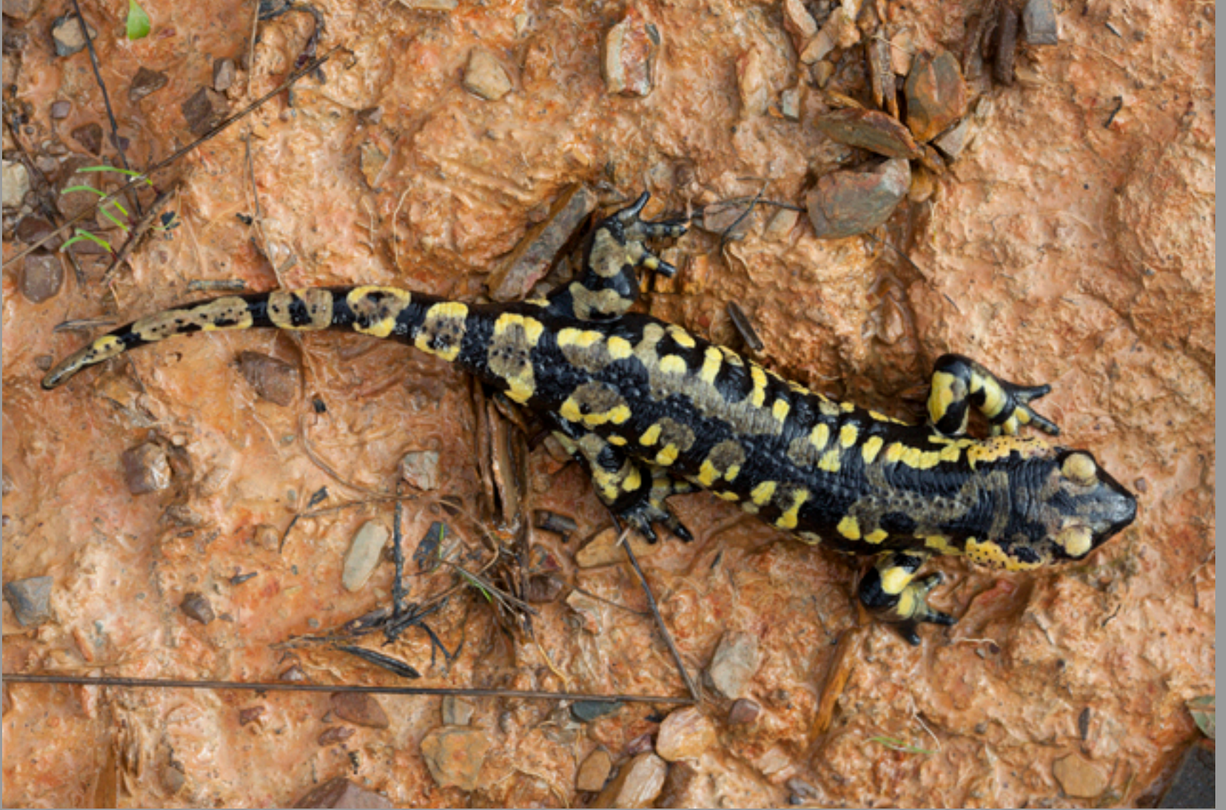
Salamandra salamandra crespoi aff. gallaica , male